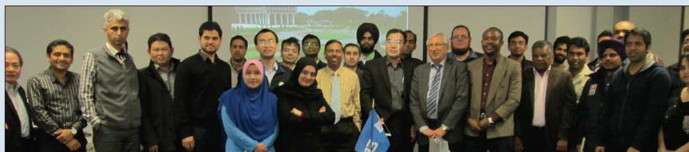
2015 IEEE DL-NSRG workshop attendees in Auckland.