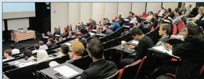
2015 IEEE NZ Wireless workshop participants.