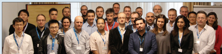
Participants of RNDM 2015.

With the increasing level of uncertainty resulting from unpredictable disturbance/perturbations, unexpected changes/variations, (un) voluntary disruptions, malfunctions, and changes in usage patterns due to socio-economic or technological evolution, current network design, as well as verification and validation methods, are confronted to the fundamental challenge of meeting inter-dependent properties involving resilience, robustness, and sustainability.